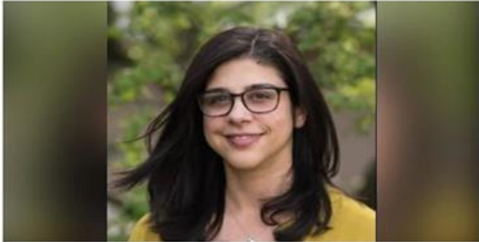
North Cook News