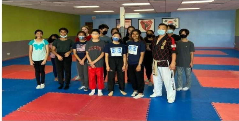
Safe&Aware's 2022 Youth Cohort.